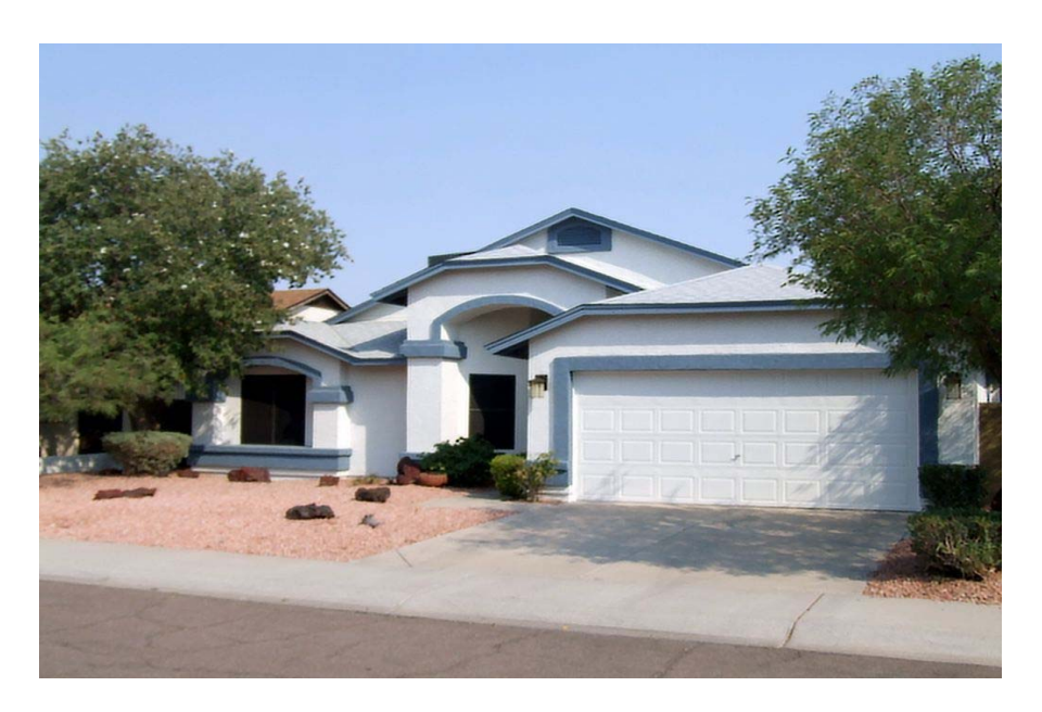
Do — Here is a beautiful example of scheme 12. Note the bump outs are painted on all three sides.