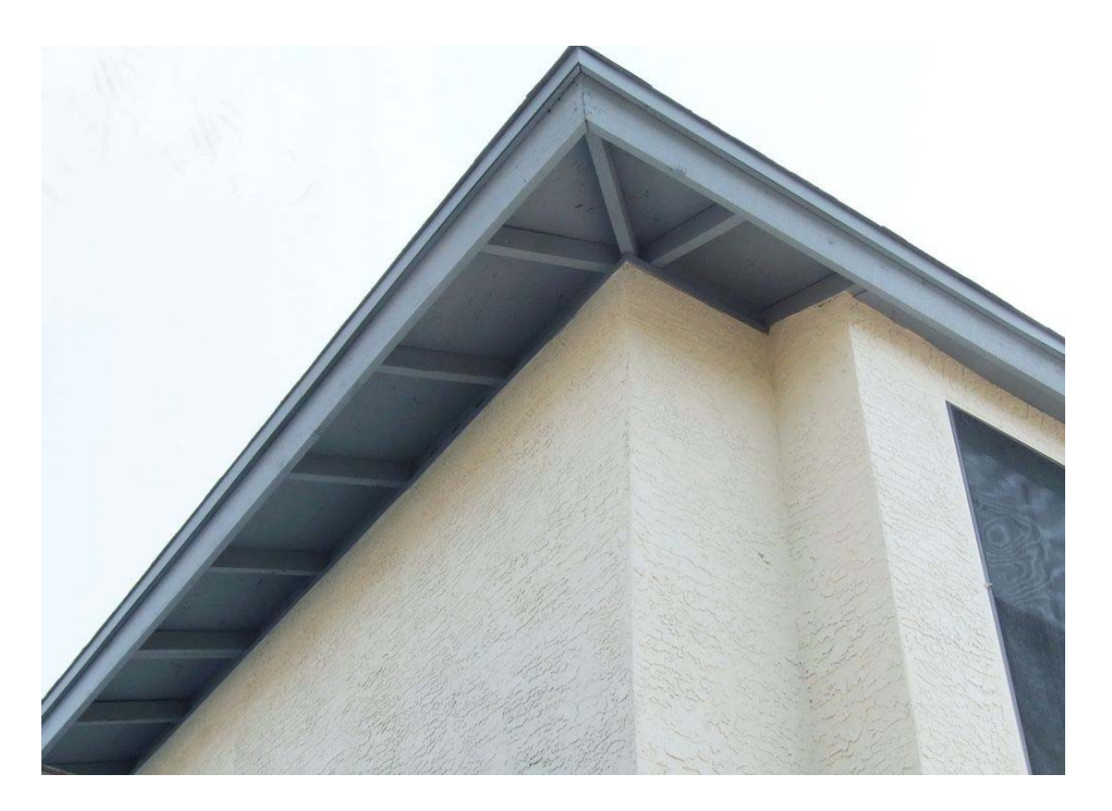
Do — The eve should be completely painted to match the Trim Color.