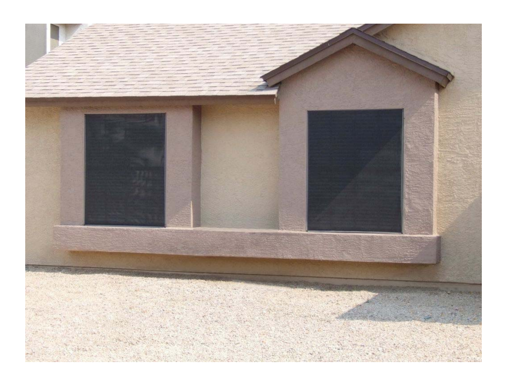
Don't — The homeowner used three colors in place of the allowed two colors referenced in the CC&R code indicating only Two.