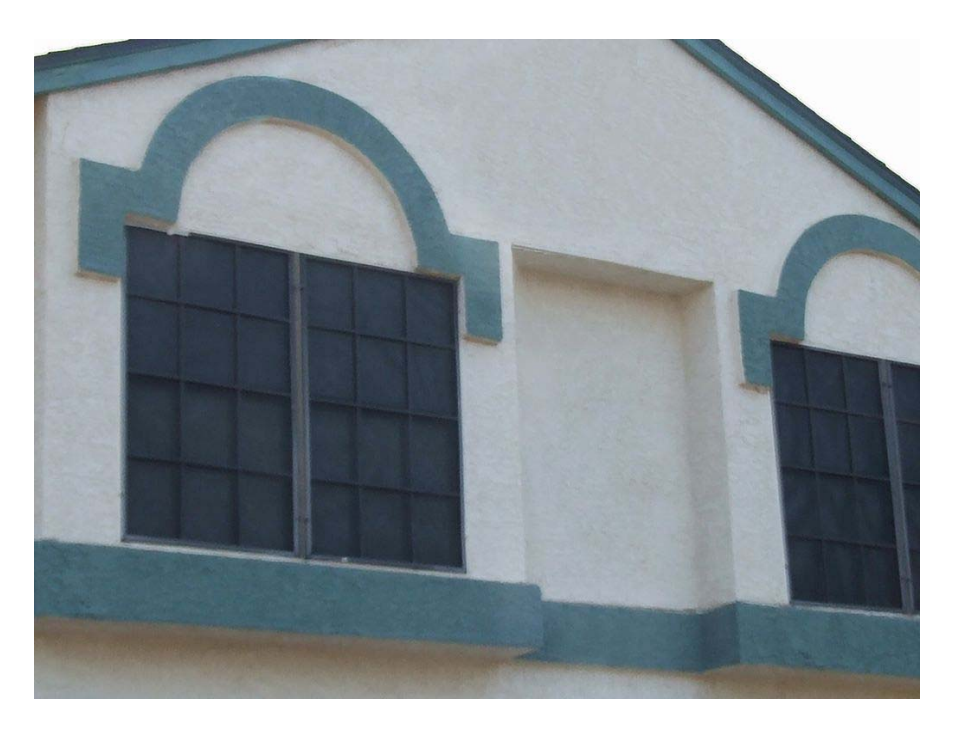
Don't — Bump outs must be painted on all three sides, not just the front as shown above.