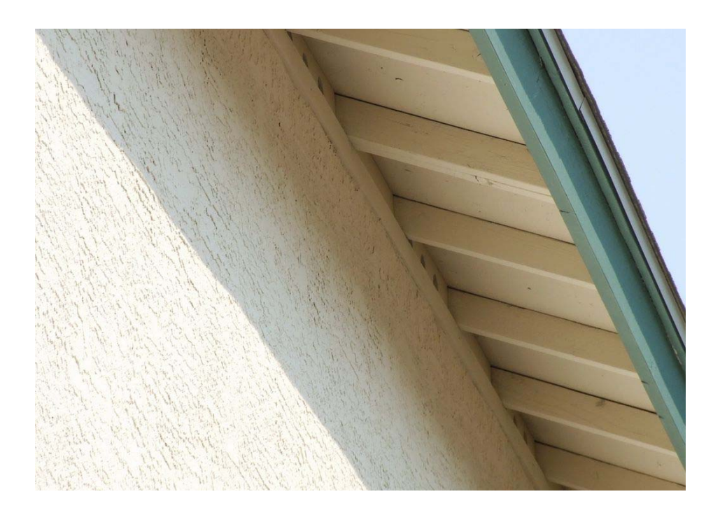
Don't — Painting only the Trim Face is unacceptable.