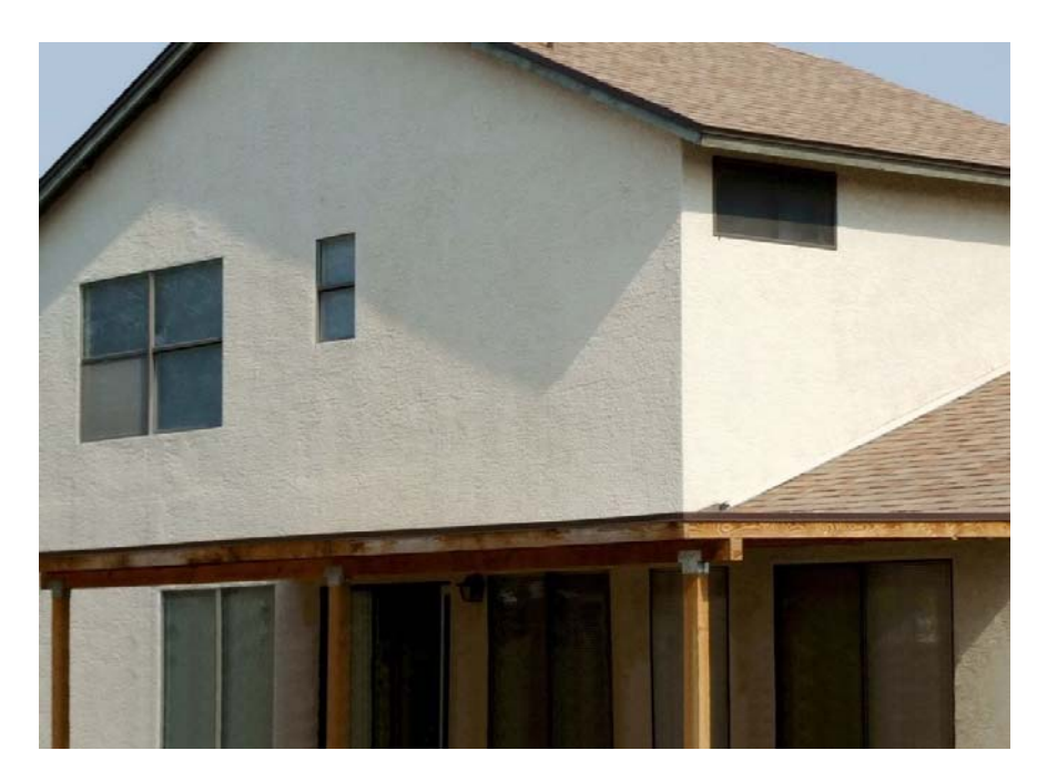
Don't — The porch supports Must be painted to match the trim of the house..