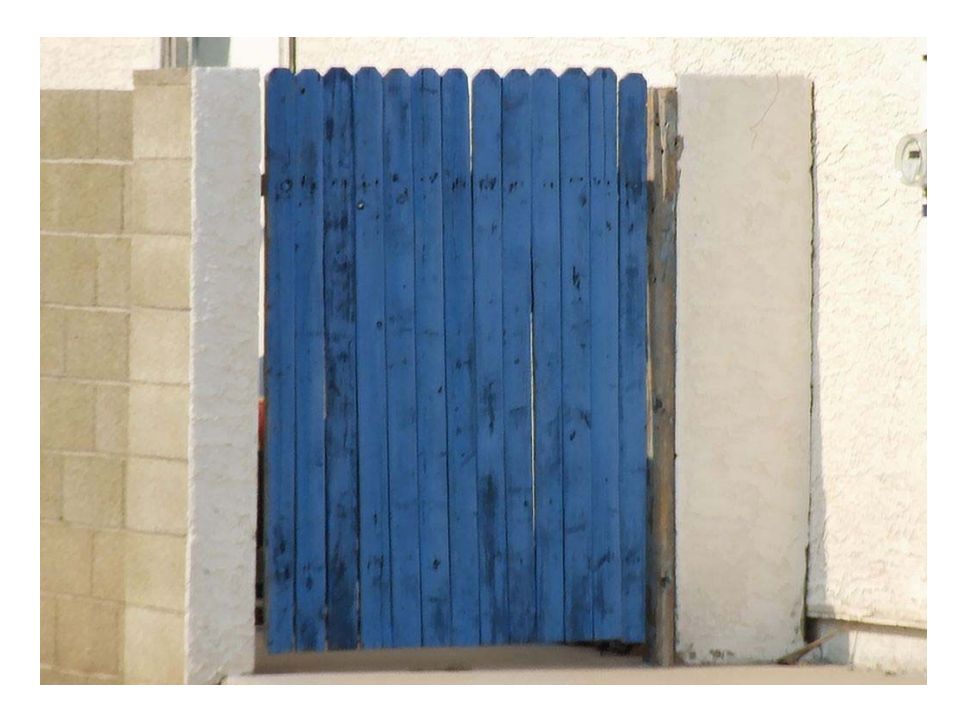
Don't — Gates may be painted either the same as the Main Body, Trim Color, or Natural wood. Natural Wood Gates must be sealed.