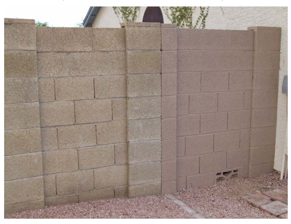
Wall (right) with painted block next to stained unpainted wall.