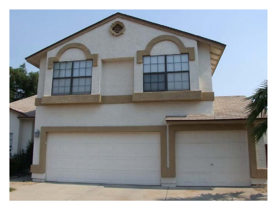
Do — Here is another example using the approved two color scheme. Bump outs are to be painted on all three sides.