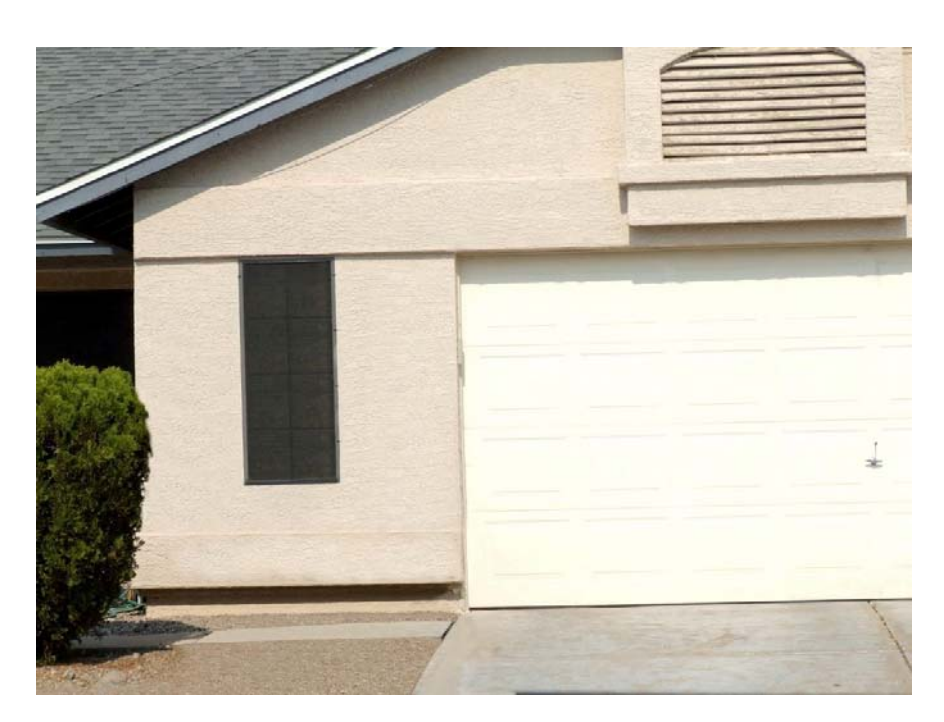
Don't — The garage door and trim are scheme 12, However the Homeowner added a third main body color.