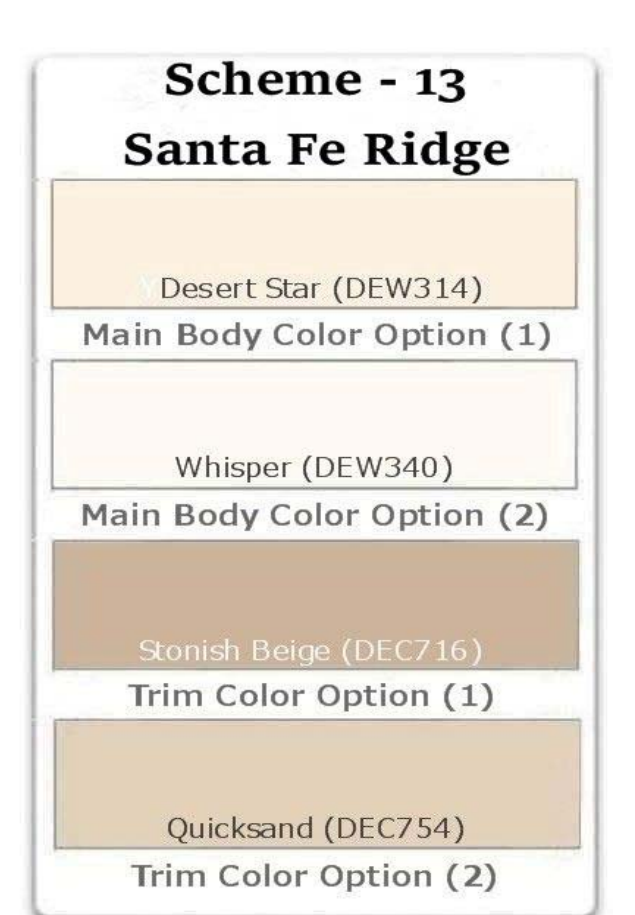
Scheme - 14 Santa Fe Ridge Quicksand (DEC754) Main Body Color Stonish Beige (DEC716) Trim Color