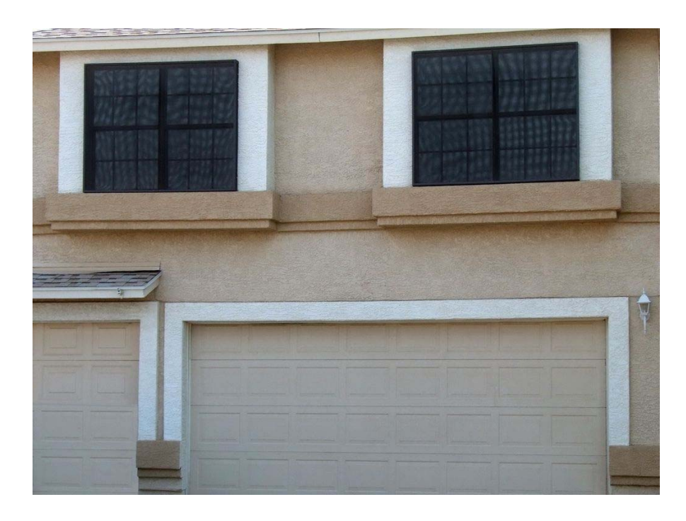
Don't — Not following the approved color schemes, this home owner used four colors in place of the the standard two.