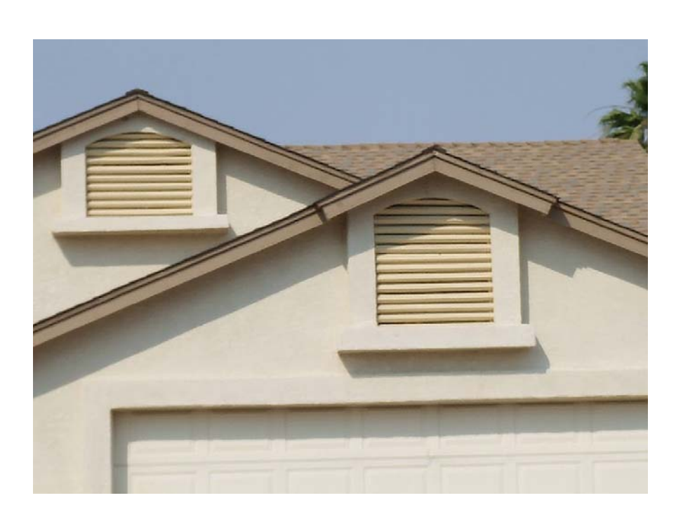
Don't — Louvers must be painted the same as the Main Body color or the Trim color.