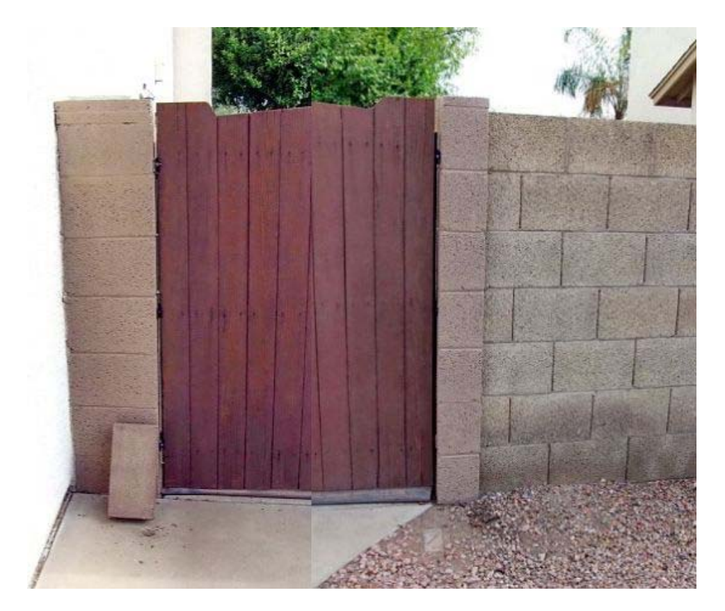
Gate with painted block next to stained unpainted wall.