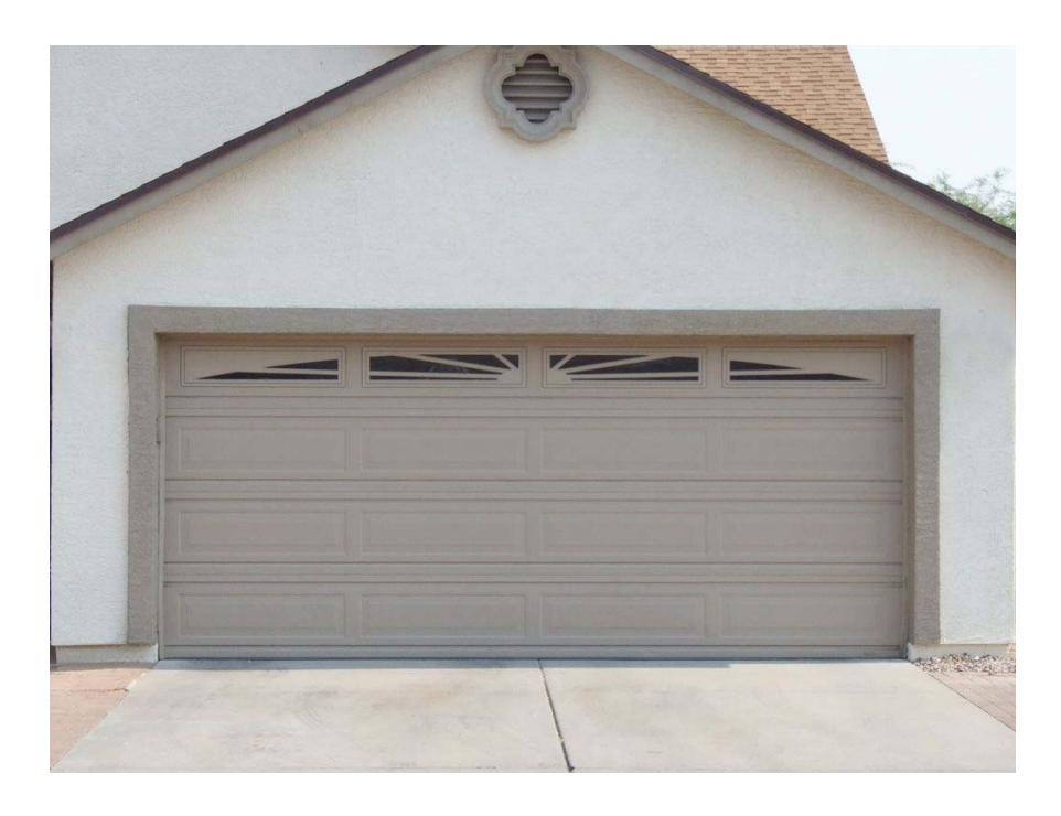
Don't- Garage door must be paint same color as body or trim. It is the owners choice.